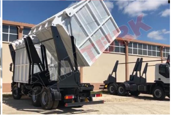
Application on truck chassis - "High Dump Forage Wagons | Sugar-cane Transport Equipment"