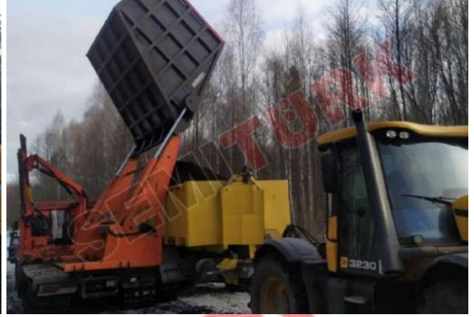
Application on tracked vehicle chassis - "High Lift Side Dump Box for Silage Harvesting"