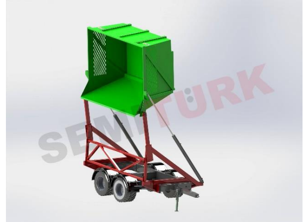
Application on trailer chassis - "Sugarcane Self Tipper / Tipping Trailer"